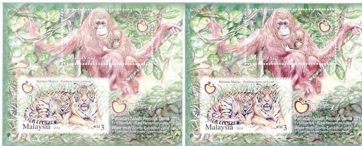
Figure 1. Colour shade variation in a pair of miniature sheets (SG MS2047) from the World Youth Stamp Exhibition, issued by Pos Malaysia in December 2014. On left is Variety 1, to the right is Variety 2.