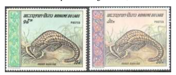
Fig. 5. Manis pentadactyla Laos 1969, Sc#193–93

Laos issued two stamps with this species (captioned Panis auritas ) on 6 November 1969, with face values 15k (Sc#192) and 30k (Sc#193) (Fig. 5), and another as part of a set of fauna stamps on 15 August 1985, with a 10k face value (Sc#649) (Fig. 6).