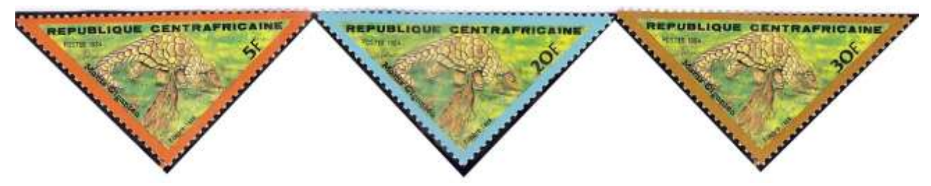
Fig. 16. Smutsia gigantea Central African Republic 1985, Sc#J13–15

The largest living pangolin, the Giant Pangolin ( Smutsia gigantea ), inhabits the equatorial region of Africa from Uganda to western Africa. The maximum weight attained of this animal is 33 kg (72 lb). This species is associated with savannahs as well as lowland rainforests.