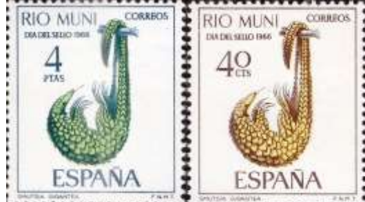
Fig. 21. Smutsia gigantea Rio Muni 1966, Sc#60 & 62