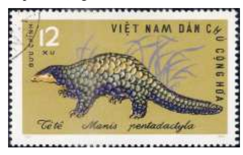
Fig. 9. Manis pentadactyla North Vietnam 1965, Sc#352