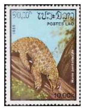
Fig. 6. Manis pentadactyla Laos 1985, Sc#649