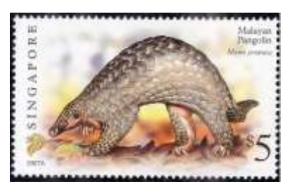
Fig. 15. Manis javanica Singapore 2007, Sc#1258