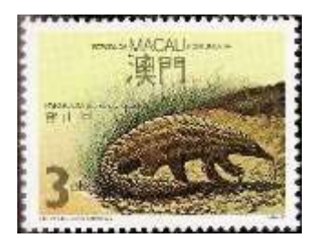
Fig. 7. Manis pentadactyla Macao 1988, Sc#564