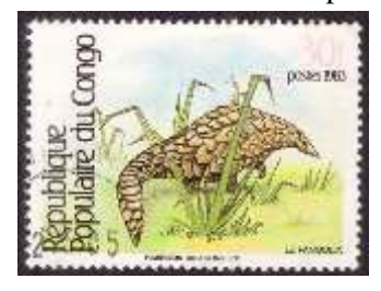
Fig. 32. Phataginus tricuspis Congo D.R. 1984, Sc#720

In December 1984, the Congo People's Republic issued a set of three fauna stamps with the 30fr value (Sc#720) showing a Tree Pangolin (Fig. 32). In 2006, they issued a set of four animal stamps with this species on the 50fr value (Sc#1277).