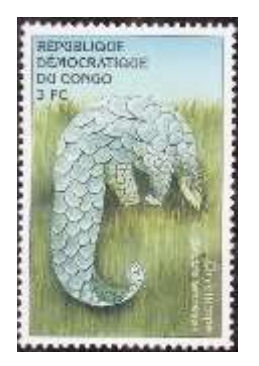
Fig. 26. Smutsia gigantea Congo D.R. 2000, Sc#1510