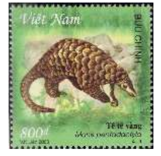
Fig. 10. Manis pentadactyla Vietnam 2003, Sc#3179