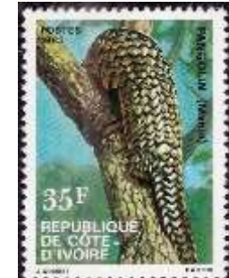
Fig. 35. Phataginus tetradactyla Ivory Coast 1983, Sc#669

Stamps of this species have been issued by several countries. These include a miniature sheet of twelve 5d stamps titled "Animals of West Africa" issued by Gambia on 5 April 1993, which depicts this pangolin on one stamp (Sc#1359c). Also, on 5 April 1993, Gambia issued a set of four stamps (Sc#1362–65) plus a 20d souvenir sheet (Sc#1366) showing the Long-tailed Pangolin. On 16 July 2001, Gambia issued a 25d souvenir sheet (Sc#2494) featuring this species.