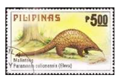
Fig. 1. Manis culionensis Philippines 1979, Sc#1408

The first was released on 14 May 1979, with face value 5p (Sc#1408). The catalogue calls it an "anteater" and it is incorrectly captioned Paramanis culionensis (Fig. 1). The second stamp was issued on 12 August 1994, with face