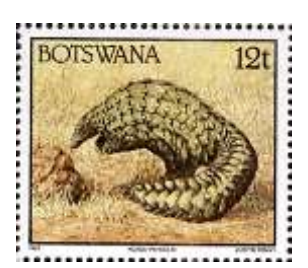
Fig. 25. Smutsia gigantea Botswana 1992, Sc#523