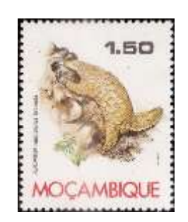
Fig. 27. Smutsia gigantea Mozambique 1976, Sc#557

On 28 February 2000, the Congo Democratic Republic (Zaire) issued a set of six stamps depicting African flora and fauna with one 3fr stamp (Sc#1510) showing a Ground Pangolin (Fig. 26). The Great Britain personalized commemorative sheet issued on 10 October 2018, and referenced above, also shows this species.