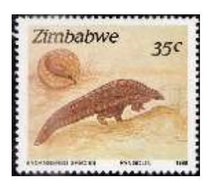
Fig. 36. Phataginus tetradactyla Zimbabwe 1989. Sc#597

On 12 March 1983, Ivory Coast issued a set of four stamps featuring animals with the 35fr face value (Sc#669) showing the Long-tailed Pangolin (Fig. 35). On 31 May 1999, Sierra Leone issued a miniature sheet of six 900le stamps, one of which shows this species (Sc#2204c). The Black-bellied Pangolin is also shown on the CITES miniature sheet (Sc#1556a) from Republic of South Africa issued on 26 September 2016, mentioned previously. On 10 October 1989, Zimbabwe issued a set of six stamps featuring endangered species with the 35c denomination (Sc#597) showing this species (Fig. 36). On 2 January 1990, Zimbabwe issued another set of six animal Figure 1990, Simbabwe issued another set of six animal stamps with this species shown on the 4c value (Sc#617 & Sc#617a).