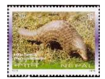
Fig. 3. Manis crassicaudata Nepal 2005, Sc#762b