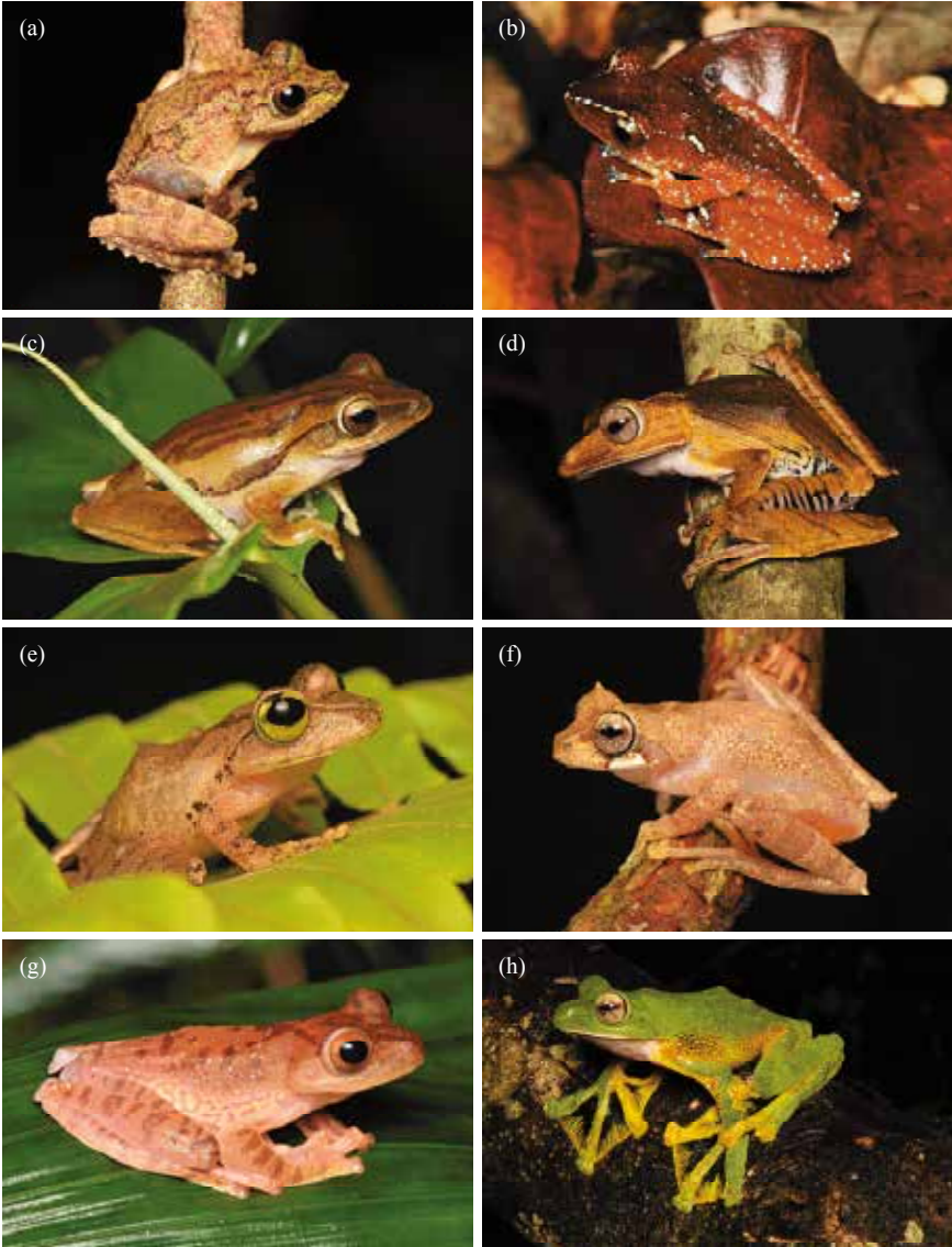
Fig. 5. Representative species of Rhacophoridae found in Pelagus National Park. (a) Kurixalus chaseni ; (b) Nyctixalus pictus ; (c) Polypedates leucomystax ; (d) Polypedates ottilophus ; (e) Philautus hosii ; (f) Leptomantis gauni ; (g) Rhacophorus pardalis ; (h) Rhacophorus nigropalmatus .