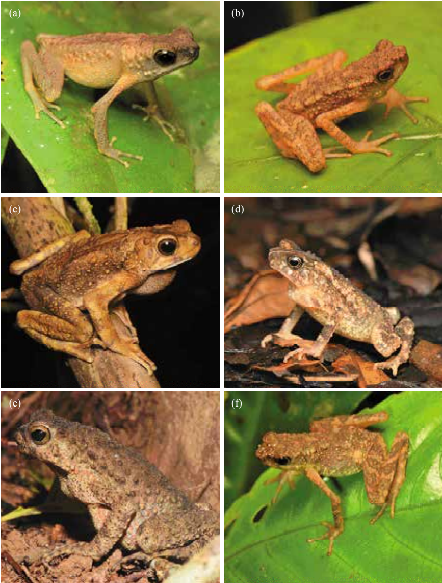
Fig. 1. Representative species of bufonids found in Pelagus National Park. (a) Ansonia leptopus ; (b) Ansonia longidigita ; (c) Rentapia hosii ; (d) Ingerophrynus divergens ; (e) Phrynomoides asper ; (f) Ansonia minuta .