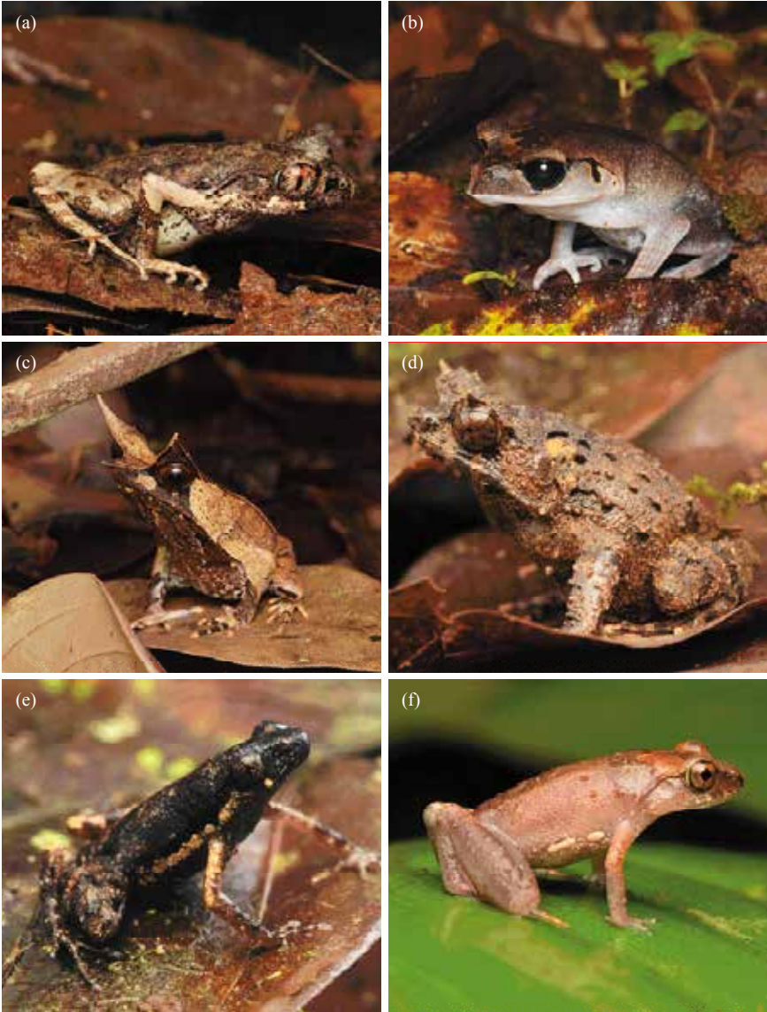
Fig. 3. Representative species of Megophryidae found in Pelagus National Park. (a) Leptolalax gracilis ; (b) Leptobrachium abbotti ; (c) Megophrys nasuta ; (d) Megophrys edwardinae ; (e) Near Threatened Leptobrachella serasanae ; (f) Leptobrachella mjobergi .