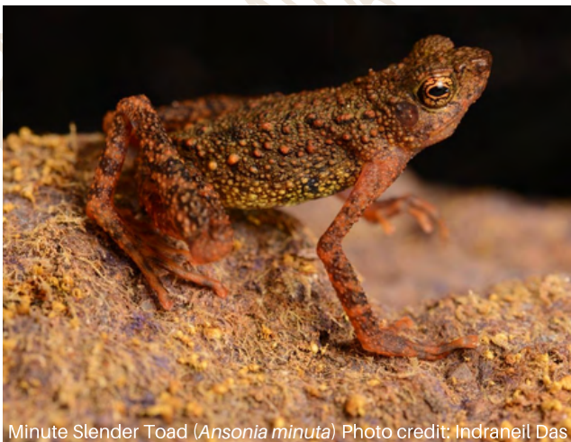
Minute Slender Toad ( Ansonia minuta )

Despite its 9th anniversary celebrating frog diversity, many common folks here imagine a group of frogs put before the line, ready for release and at least one hop to the finish line. No, that does not happen at our Race!