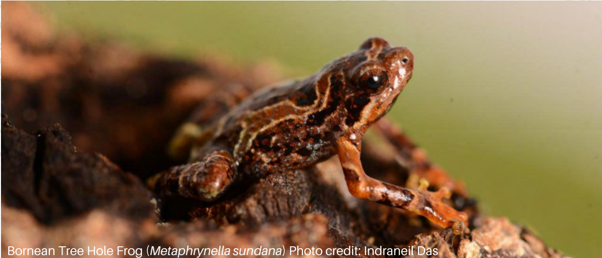
Bornean Tree Hole Frog ( Metaphrynella sundana )

Pang Sing Tyan, Pui Yong Min & Indraneil Das