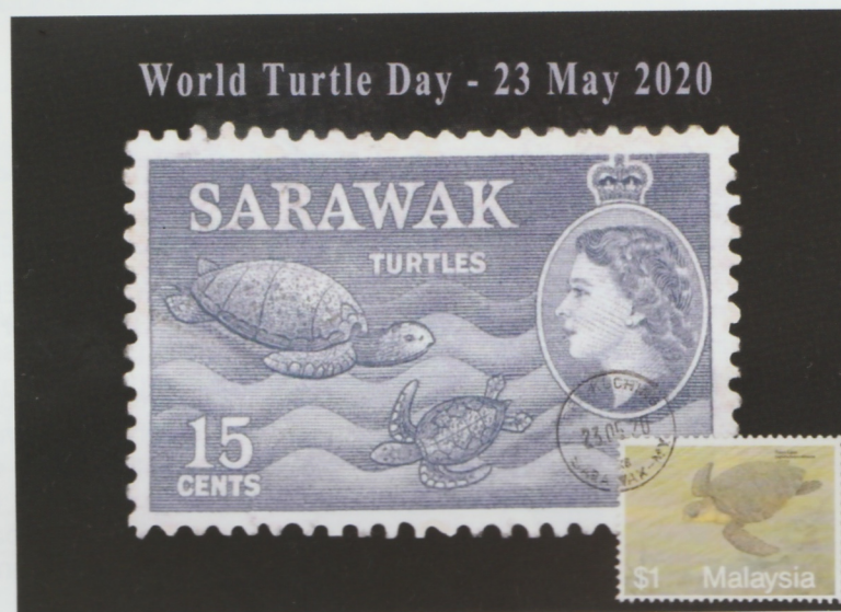
Figure 1. Printed postcard issued for World Turtle Day, 23 May 2020, based on the design from SG 195 (issued in 1955), affixed with a $1 stamp depicting an Olive Ridley Sea Turtle ( Lepidochelys olivacea , SG 453 (issued 1990)).

Turtles are one of the most threatened animal groups, with over half the species in danger of extinction. Yet, these are proverbially the longest-lived species on earth, in addition to being the symbol of patience and good luck in many Asian cultures.